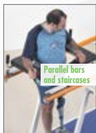
Parallel bars and staircases

Printed in November 2014, 19 pages, English edition.